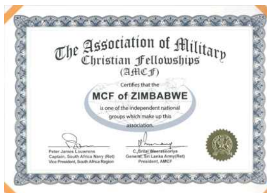
Establishment Certificate of ZMCF