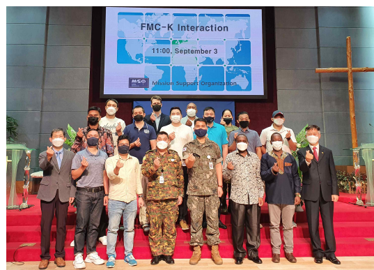
Regional Graduation Ceremony at the Army War College Chapel (Sept 3)