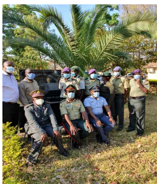
Founding Members of ZMCF