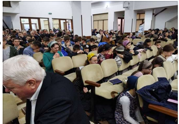
Kneeling Prayer for the Ukrainian War Refugees and for the End of the War (at a Church in the vicinity of Romanian Border)