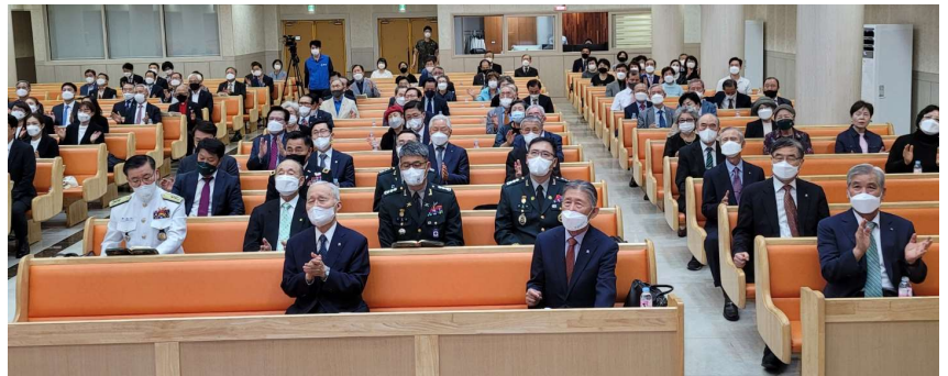
"Who will protect us?"