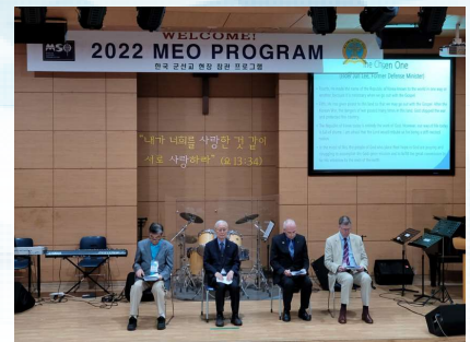
Dialog with AMCF Leaders