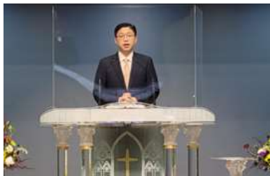
Dawn Prayer Meeting at CMC