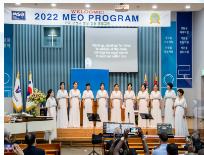
Praise (Heaven Voice Choir)