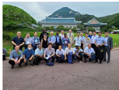
At the Blue House