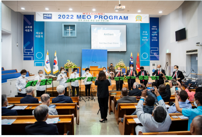
Performance of Soli Deo Chime