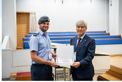
Certificate of Completion Awarded