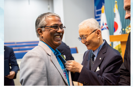
AMCF Badge Awarded