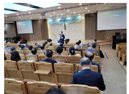
Sunday Evening English Service at Shingil Church