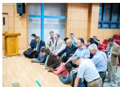
Prayer for the African Reporters