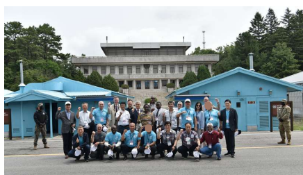
Visit to Panmunjeom