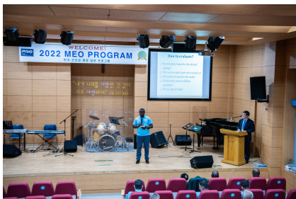
Inductive Bible Study (IBS)