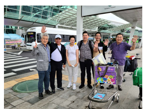
Farewell of Central Asian Delegates

The achievements and significance of MEO-P in 2022 can be summarized as follows. First, it was resumed as a face-to-face program for the first time since 2019, overcoming various difficulties caused by the COVID-19 pandemic.