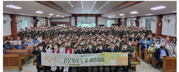
Group Photo after the Baptismal Ceremony