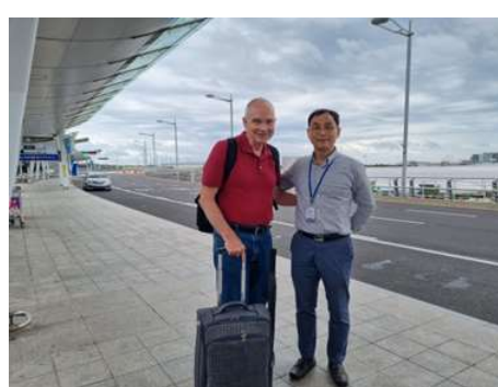
Farewell at the Airport (Col Exner)