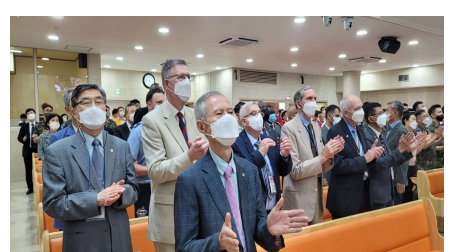
Prayer Meeting in Commemoration of Korean War