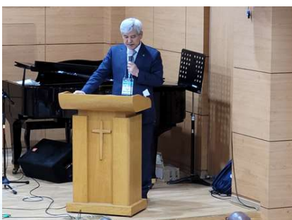
Welcome Remarks (MSO Chair)