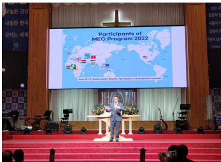
Sunday Morning Service at Immanuel Church