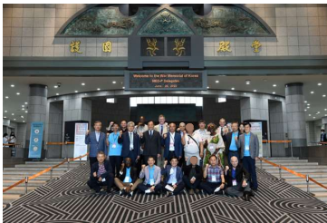
Korean War Memorial