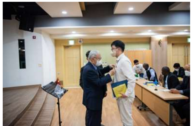
Conferment of AMCF Badge

(e) With God's guidance, all participants were able to complete the Interaction safely and fruitfully even in the COVID-19 Pandemic. 39 active duty officers and cadets from 16 countries participated in and completed the 2022 FMC-K Interaction, which is believed to greatly contributed to nurturing the MCF leaders of the AMCF. In addition, many officers from other religions actively participated in the Interaction and had a valuable opportunity to understand Christianity. After returning to their home countries, they are expected to have a positive influence on the work of AMCF as leaders of their own military.