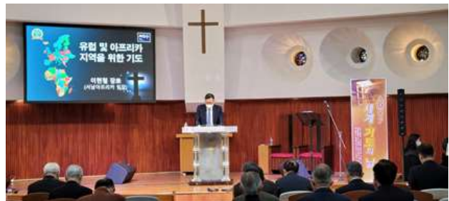
Representative Prayers for the AMCF regions