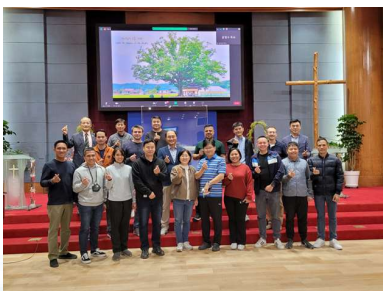
At Jawoon Church (for Army, Naval and Air Force College Participants)