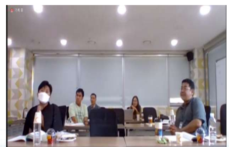
At National Defense University Chapel (for KNDU Participants)