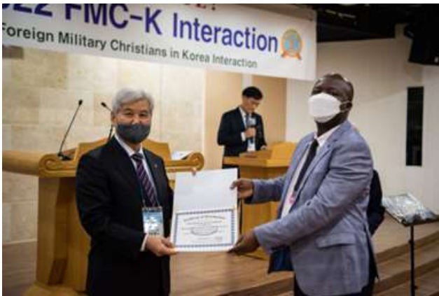
Conferment of Certificate