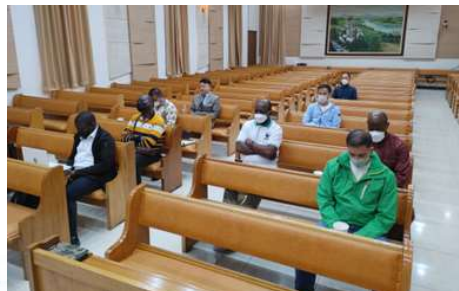
At Sangseungdae Church (for Korea Defense Language Institute Participants)