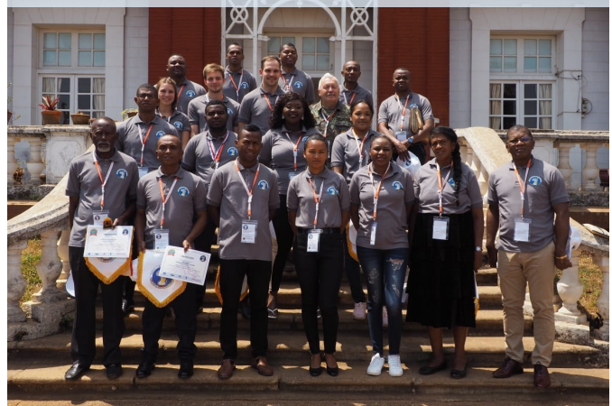
MMTI 2022 Participants