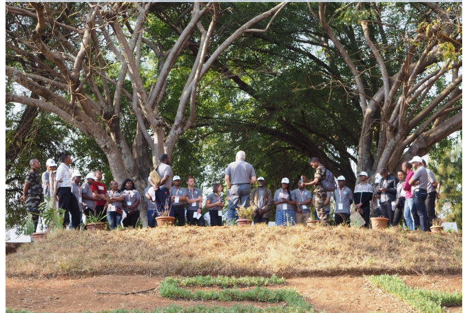
Participants attending Sunday's service at the Antsirabe Military chapel