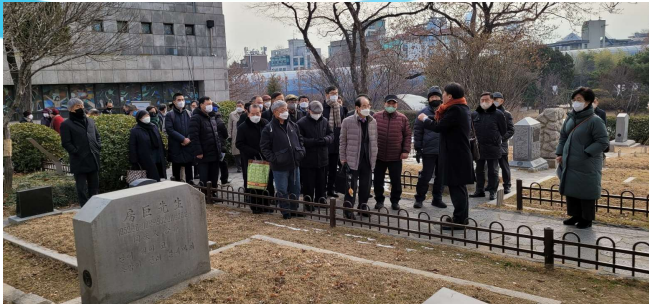
Pilgrimage to the Foreign Missionaries Cemetery