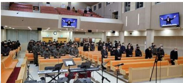
Joint Breakfast Prayer Meeting

It was also decided to have a joint breakfast prayer meeting and a cooperation meeting between/among the military missionary organizations on the first Wednesday of every month to cooperate and coordinate military ministry activities of active and reserve Christian service members.