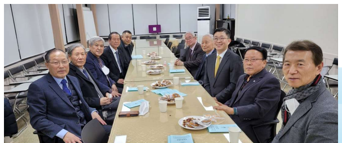
Military Missionary Organizations Cooperation Meeting