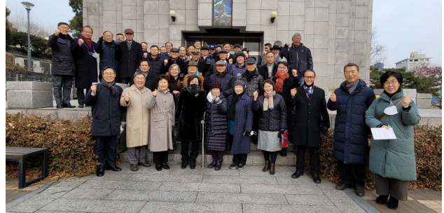
Greetings at the Missionary Memorial Building