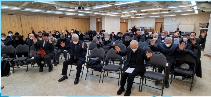
Group Prayer at the New Year's Service