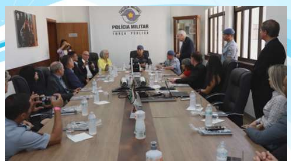
Visit to the São Paulo Military Police Headquarters