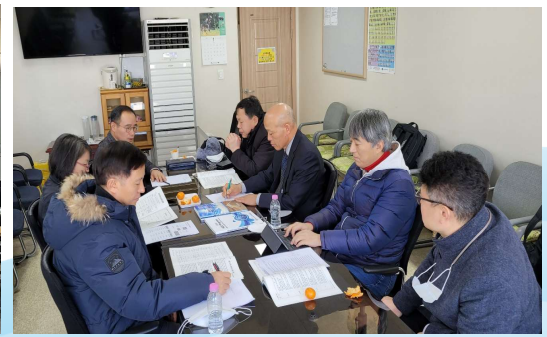
Discussion, Education and Training Bureau