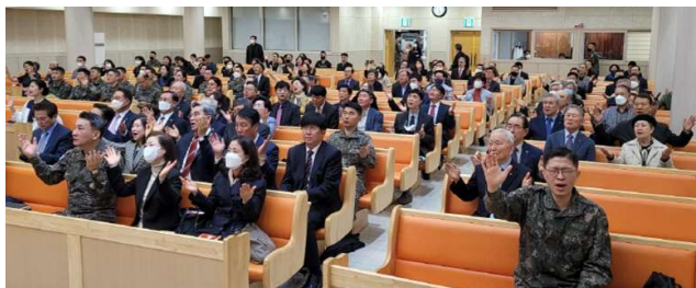
Joint Breakfast Worship Service

At 07:00, at the cooperation meeting of the delegates dispatched by the military mission-related organizations, major ministry activities were reported by each organization. A demand was raised to further develop a detailed plan for cultivating baptized Christian soldiers. MSO shared with them the MEO-P and the FMF-K Interaction (scheduled in October) plan, and other ministry activity information.