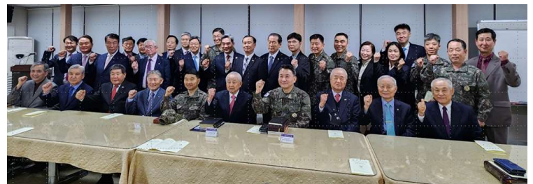
Cooperation Meeting of the Delegates of Military Ministry-related Organizations