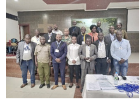
AMPBCA, Baptist Church, Luanda

At the beginning of November, the Angolan MCF held their third annual conference in the facilities of the Baptist Church, Luanda, with more than 20 delegates participating from Luanda and other provinces. The aim was to encourage the members, develop the association and approve the necessary statutes in order to continue with the official registration process.