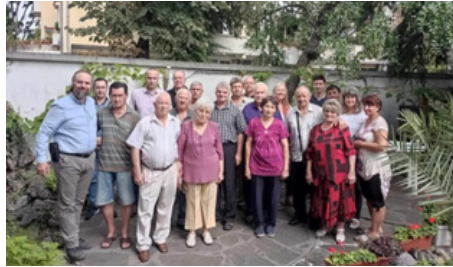
Bulgaria MCF 25th anniversary

On 16th September 2023 the St George Bulgarian MCF celebrated its 25th Anniversary.