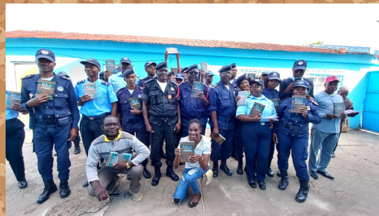
Angola bible distribution