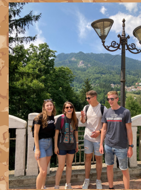
SAR Officer Cadets