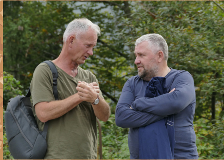
The Adria MMI team