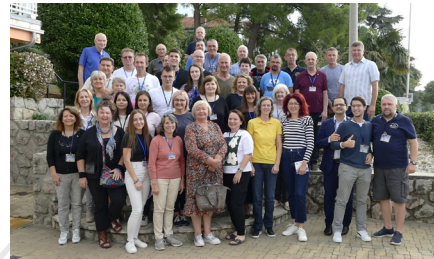
The Adria Interaction group

The conference provided a well-balanced mix of spiritual depth, personal engagement and leisure. On Friday an excursion was organised to the caves of LOKVARKA, followed by a lunch and a walk through the woods, giving wonderful opportunities to meet and interact. There was also ample time to meet each other over the wonderful meals and the free time.