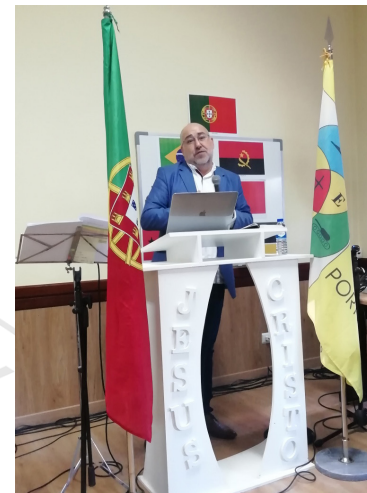
MEP bible teaching

We had some very good and enriching Bible teaching from the Director of the Theological College.