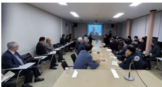
AMCF/MSO Introduction(Secretary General)