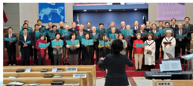
MSO Staff Special Praise