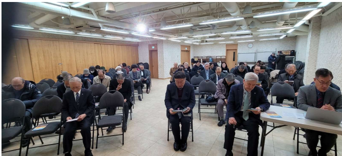
The New Year's Service

MSO members, who regard themselves as being indebted to the Gospel, have been making a strong start to their annual global military missionary work by holding the New Year's Service at and a pilgrimage to the cemetery since 2005 every year, renewing their resolution to fulfill their global military missions.