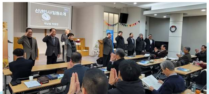
Introduction of New Executives