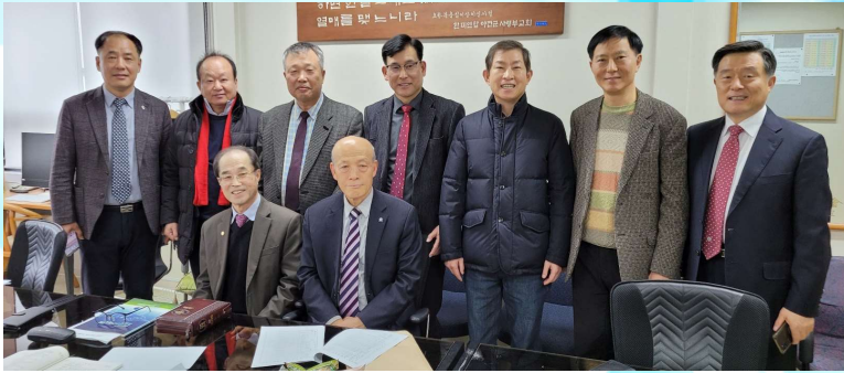
The Education and Training Bureau