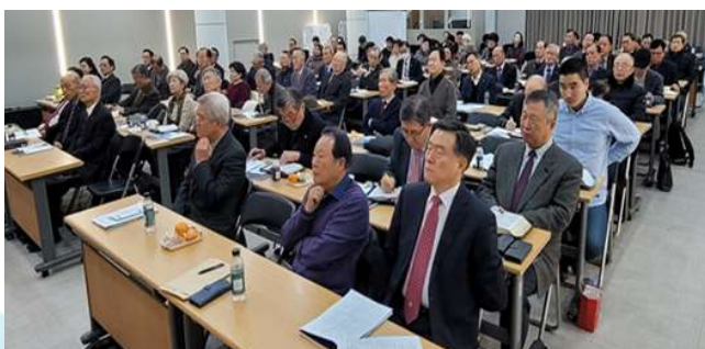
The MSO New Year's Retreat