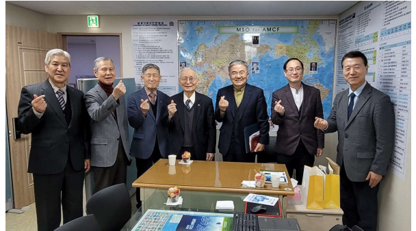
Lecturers and MSO Executives