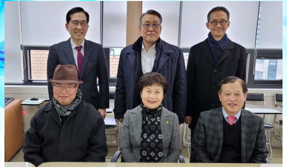
The Domestic Operations Bureau