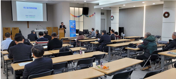
The World Mission Bureau