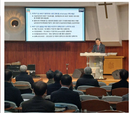
Ministry Report by Col Chang