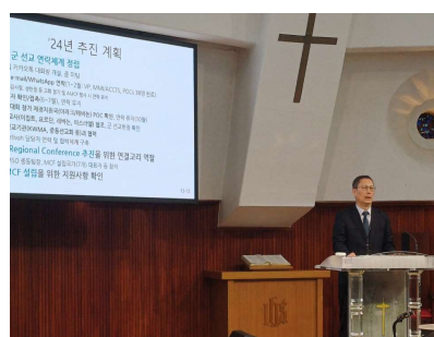
Ministry Report of Middle East