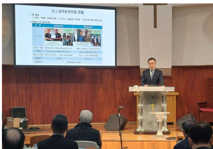
Ministry Report of Southwest Africa