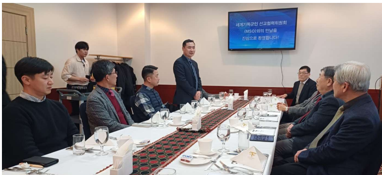
Self-Introduction of Christian Military Attachés

The event was held in the order of the Chairman's Welcome Address followed by introduction of AMCF/MSO, a prayer of thanks, and fellowship. This event was held for the first time in 2023 by inviting 6 Christian Military Attachés, and was held for the second time this year to introduce world military missionary work to military attachés to be dispatched around the world and to lay the foundation to develop them as future MSO leaders.