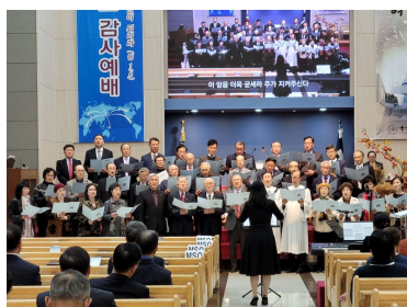
Special Song-MSO Members