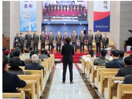
Special Song-KMCF Choir