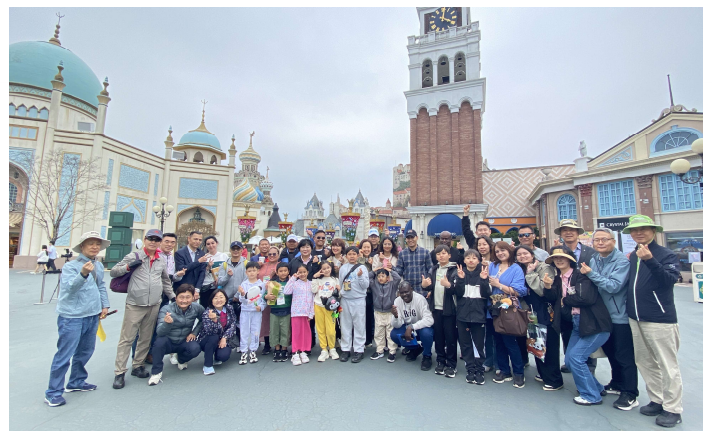
Everland Theme Park