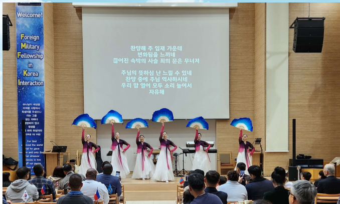
Korean Traditional Fan Dance