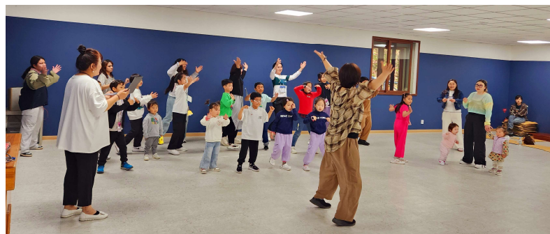
Mom's & Kid's Program