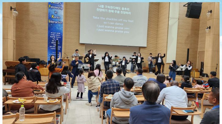
K-POP Praise Songs