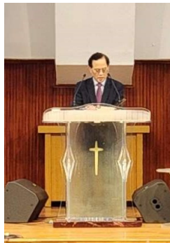
Ministry Plan Report