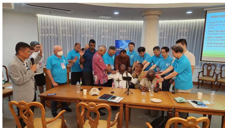
Prayer for the Participants