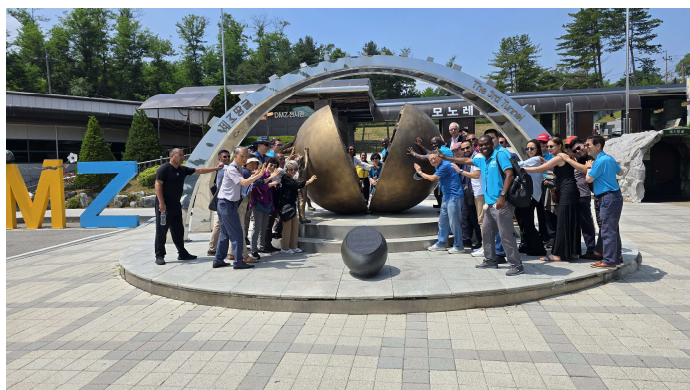
Dora Observatory & The Third Tunnel