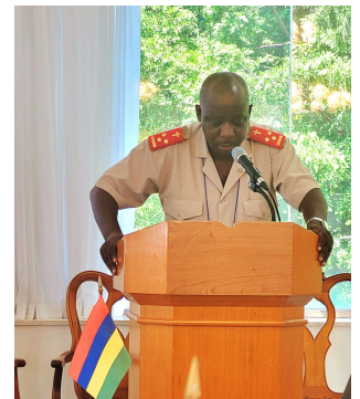
Appreciation Address – Burundi Participant