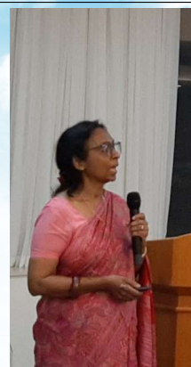
National Report – Mauritius (Left), India (Right)