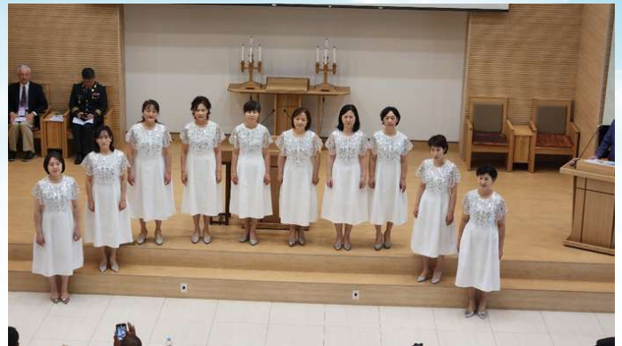
Special Song – Heaven Voice Choir