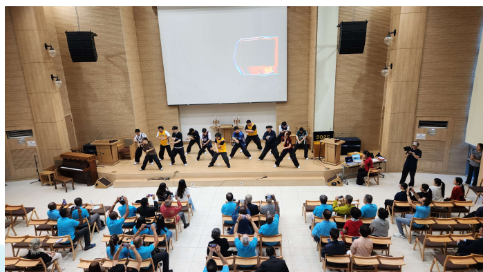
K-POP Worship Dance