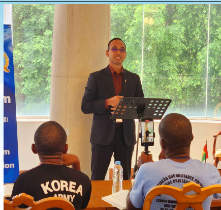
Personal Testimony – Uganda (Left), Thailand (Right)