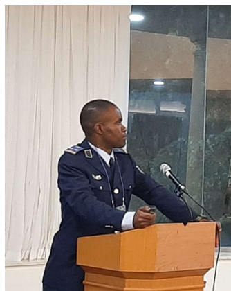
National Report – Liberia (Left), Angola (Right)