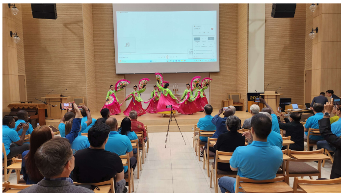
A Traditional Korean Fan Dance