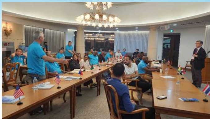
Theme of the 2024 World Conference and Its Application at the MCF Level