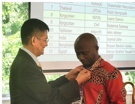
Presentation of the AMCF Badge