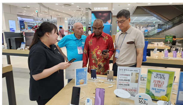
Shopping at Lotte World Mall