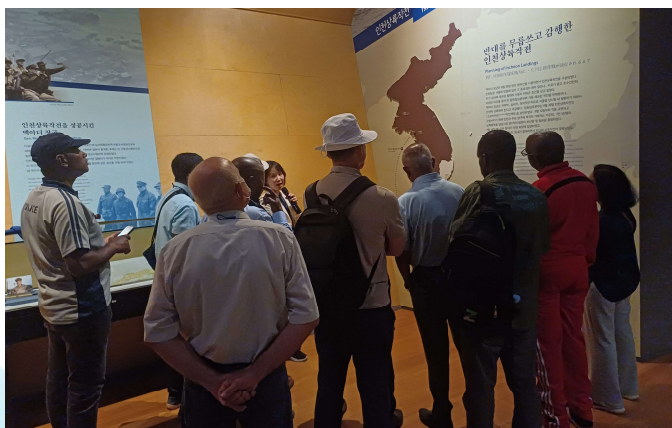
The War Memorial of Korea