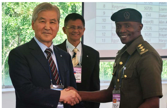
Presentation of Certificate