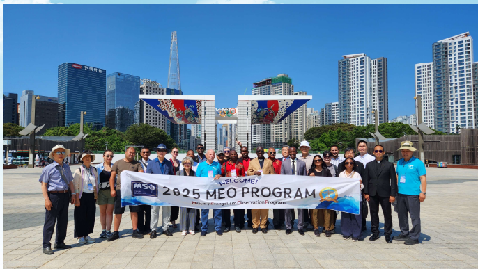
The Olympic Park