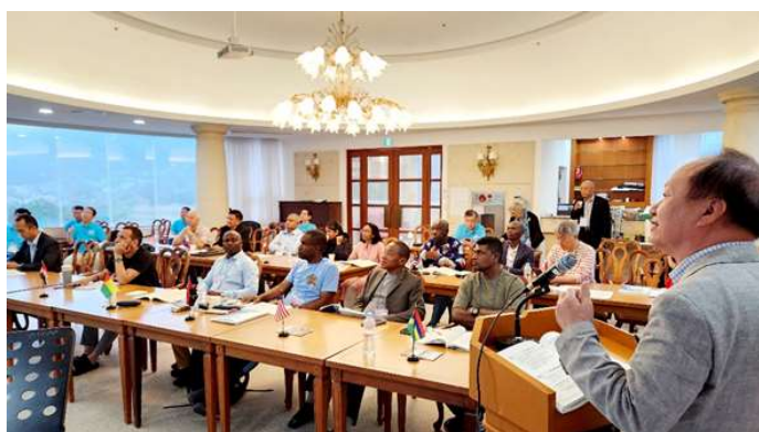
MCF Ministry (Establishment & Growth, Growth Case)