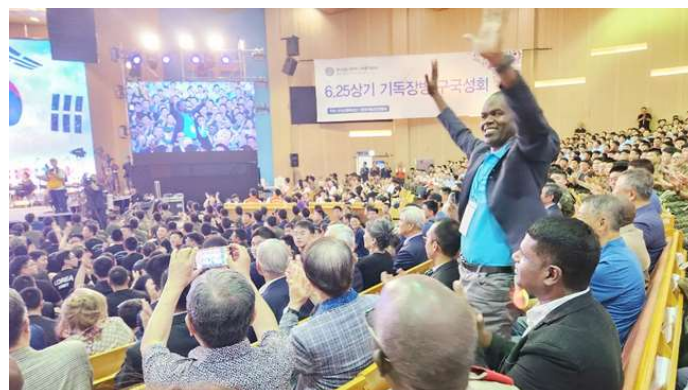
KMCF National Prayer Convention