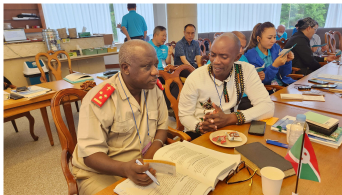
Personal Evangelism Practice