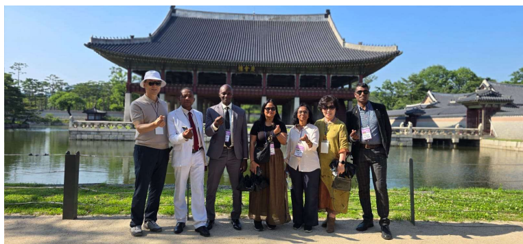
The Gyeongbokgung Palace