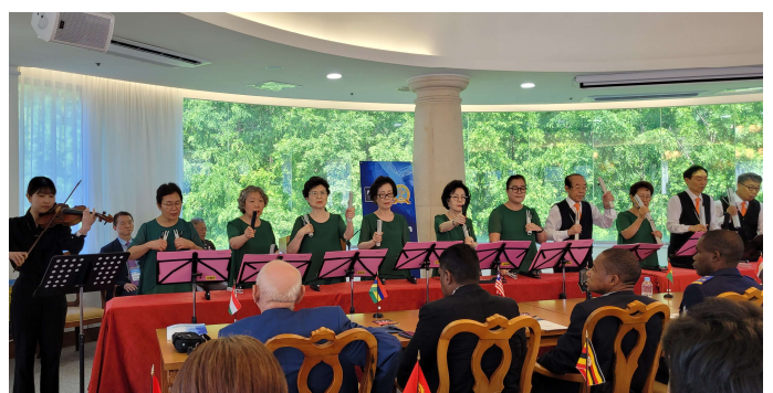
Special Performance – Soli Deo Choir Chime