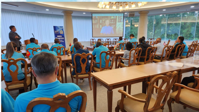
Message from the AMCF Leaders