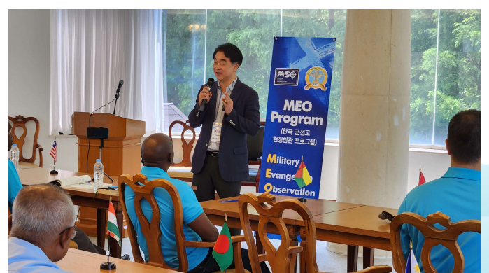
History of Korean Missions