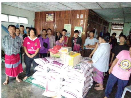
Support for Karen Refugees